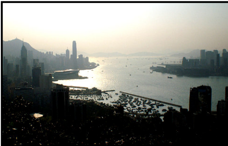
Victoria Harbour looking west 5:00 pm

An ideal location for taking photographs of Hong Kong's busy Victoria Harbour, including the Central Business District and Tsim Sha Tsui skylines can be found in the Braemar Hill Neighbourhood. The location is perched up on top of hill beside a government trigonometry (trig) station, with the view looking westward, providing ideal light for a range of times