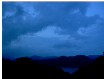
Dawn view of Little Palm Beach