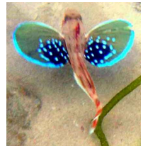
Blue Fin Gurnard found in Little Palm Beach

If your choice of transport is not getting off at Hang Hau station, you will have to take the bus instead of the taxi. After getting off the Mang Kung Uk station, keep walking up the hill, cross the junction which leads to Hang Hau Wing Lung road, and arrive a parking lot with another junction- the shortcut. Walk down the junction from the parking lot, and you will see a flight of stairs. Walk down the flight of stairs. At the end of the stairs, turn left, and walk till u meet the main road (where the garbage collection is). Keep walking down the road, on the way, you will pass a lot of houses, keep your volumes down, since people live in here, and you might disturb them. At the end of the road, there is a sharp turn to the left, a smaller road which leads down to the beach. Walk down the road, and you will soon meet the sailing club. To go to the beach itself, turn left at the roundabout, where there is a bar blocking cars entering.