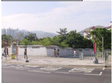
The bus stop locating outside the restaurant.

Traveler's Code of Ethics - Learn the names of your local hosts and a little of their native language.