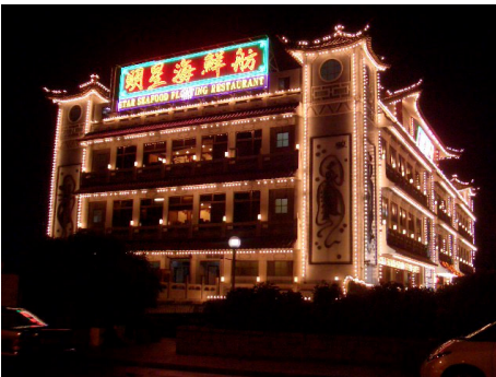
The attractive night time outlook of the floating restaurant.

85K - $4.2, 05:45 - 24:00 284 - $3.1, 06:40 - 24:00 299 - $9, 06:00 - 24:00