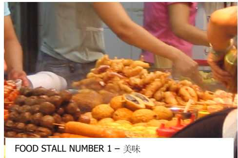
FOOD STALL NUMBER 1 – 美味

Nelson Street is located near Sai Yeung Choi's South – 西洋菜街, which is also named as Women's Street – 女人街 and its also located on the east side of "LangHam Place Shopping Mall". To take the MTR, you exit from the Mong Kok Station and go to exit E2 Bank Street, then from there you walk straight, cross the road and there you'll be in Nelson Street.