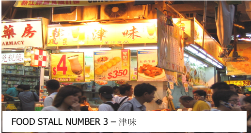
FOOD STALL NUMBER 3 – 津味