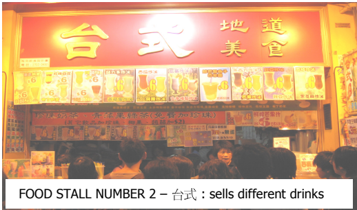
FOOD STALL NUMBER 2 – 台式 : sells different drinks

Hong Kong has always been a famous country for shopping, food, sight-seeing...etc, it is an international, multi-culture place; in here we have all different types of food from many different countries. But tourist hasn't really fully understood "Hong Kong" 's food culture. They are special, unique and other countries don't have it: "STREET FOOD STALLS"