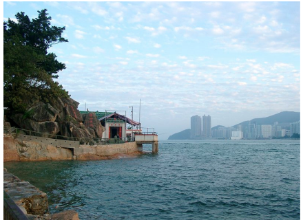
Tin Hau Temple at Lei Yue Mun. Being a fishing village this temple is a tribute to the Chinese god of the sea