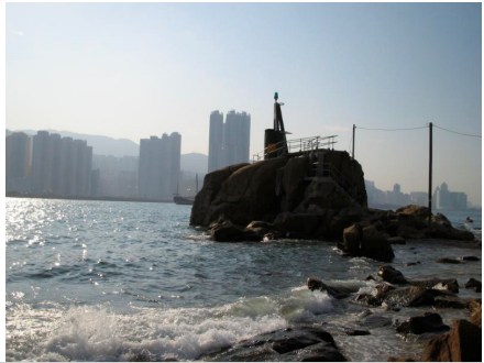
A view of Lei Yue Mun Lighthouse. It was built to warn passing ships away from the rocks on which it stands.