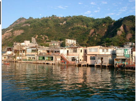
The fishing village of Lei Yue Mun as seen from the ferry Pier. Lei Yue Mun is

MTR: 5 minute walk from Yau Tong Station.