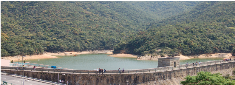
Wong Nai Chung Reservoir

Do not collect natural souvenirs Do not litter