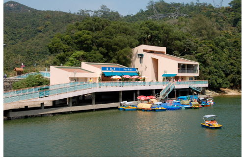
Entrance to boating pond

Hong Kong is not just a city of skyscrapers. Experience the lush greenery and stunning scenery the city has to offer at the Wong Nai Chung Reservoir Park. This disused reservoir has been converted into a boating pond. Why not rent a paddle-boat and relax and enjoy the breathtaking views while feeding the infinite number of freshwater fish. You could purchase a loaf of bread for HK$10. Feel the excitement as the fishes follow your boat wherever you paddle! See if you can spot the ducks and turtles hiding around in the bushes! If you're thirsty, hungry or simply need a rest, the outdoor cafe would be perfect, where you can enjoy some of Hong Kong's local snacks.