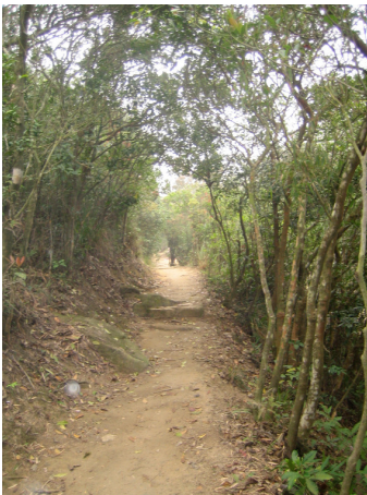
Trees line your path through nature

Starting at Braemar Hill, this 6km route leads through Siu Ma Shan, Mount Butler, Quarry Gap and finishes at Mount Parker Road, just off King's road, Quarry Bay. Immerse yourself within nature as you spot different animals and insects such as squirrels, different species of birds, butterflies and dragonflies along the hike, and admire the stunning scenery of the Tai Tam Country Park from Quarry Gap. More scenic views of Hong Kong can be seen at the summit of Mount Butler, such as the island's landforms, crowded cities, and also Victoria Harbour.