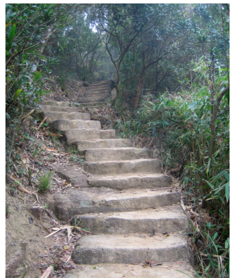
Walk along the winding trail

From the bus terminus, cross the road and walk eastward to St. Joan of Arc School, and down the stairs at the north end of the school. This is your starting point – refer to map on opposite side of guide for details on trail.