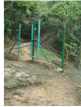
Mountain path entrance.