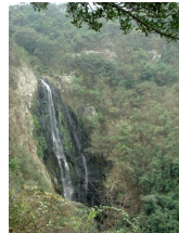
Waterfall seen on path.