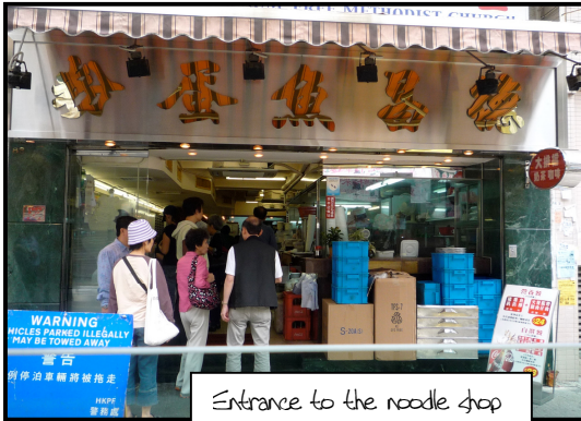
Entrance to the noodle shop

A fifteen minute walk from the MTR station, situated in a district full of a variety of restaurants, is a local noodle store. Here, one can experience the rush of the Hong Kong lifestyle as well as some delicious soup noodles.