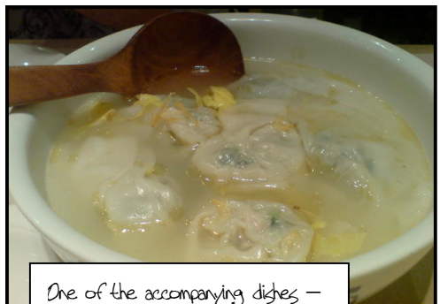
One of the accompanying dishes – home-made dumplings.

Acquaint yourself with the local customs. Respect local customs; people will be happy to help you.