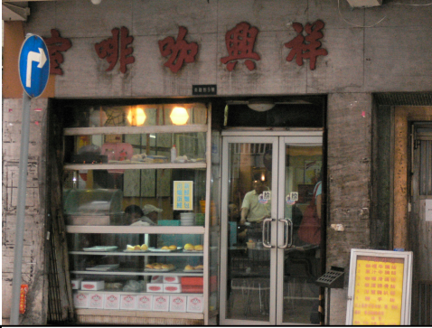
Cheung Hing Tea House (If literally translated: Cheung Hing Coffee Room)

For many years, the tea house has been a place for locals to hang out at for conversation or simply for a refreshing drink. An interesting fact about Hong Kong tea houses is that the owners of the store always works there, usually having the store owner's wife as the cashier. This particular tea house has been serving the locals of Happy Valley and many celebrities for over 53 years.