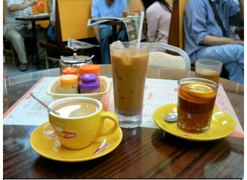
From left to right: 熱鴛鴦Coffee mixed with tea (hot), 凍奶茶Milk tea (cold), 熱檸茶Lemon tea (hot)

The tea house serves many different foods and drinks, but the most commonly ordered would be the coffee mixed with tea, cold milk tea, and the hot lemon tea. These drinks, especially the coffee mixed with tea, are drinks that Hong Kong people especially like, and have been drinking for many years. Most drinks have a choice of hot or cold, and cold drinks usually only costs around a dollar or two more. If what you want is an experience in Hong Kong food culture, then this is a must-go destination for you!