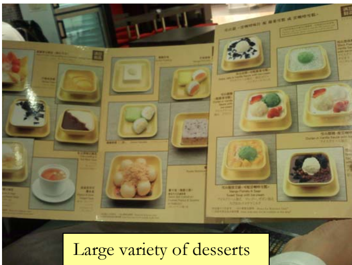
Large variety of desserts

Honeymoon Dessert has a large variety of different desserts, all made with different ingredients and placed attractively in front of the customer.