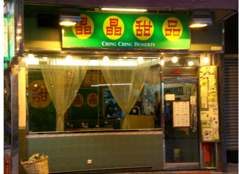
The above picture shows the store located in Electric Road.

An example of a mix between sesame sweet soup and glutinous rice balls (芝麻糊湯圓) is shown to the right.