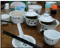
Chinese Tea sets

It is a tradition to walk in the restaurant and quickly occupy any empty seats. Expect to share table with other customers.