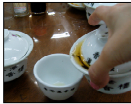
Pouring tea from a lidded teacup.