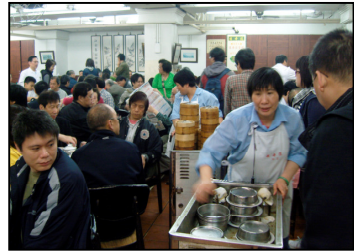
Dim sums are served on trolleys

Experience the traditional tea brewing method and enjoy fine tea with high quality tea leaves and traditional tea set of 30 years which includes lidded teacup, teacup and cup-washing pot. Brew tea by pouring boiling water into a lidded tea bowl. Then, tilt the lid of a lidded teacup and slip water along the side and pour tea into a teacup for drinking.