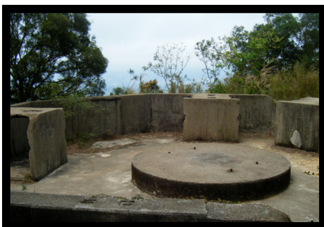
The remains of one of the two anti-aircraft guns.

The Pinewood Battery was once the highest of all costal defense batteries in Hong Kong. It was built in 1901 by the British military to strengthen the defense on the Western side of Victoria harbor. After the First World War, Pinewood Battery was used for anti-aircraft defense and two Mark 1 anti-aircraft guns were installed in the battery. However, during the Japanese Occupation of Hong Kong on December 15 th , 1941, the battery came under heavy air attacks, which led to the abandonment of the battery by the defending British army. Today, the battery is the only anti-aircraft battery in Hong Kong which still displays a “pre-war” layout, making it a must see for all tourists interested about World War II and the history of Hong Kong.