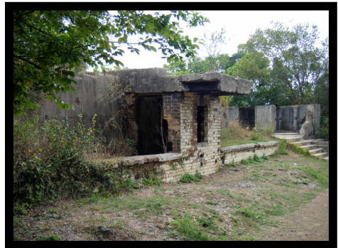
Shelter in the Pinewood Battery