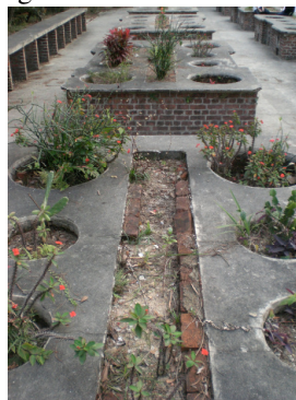
Figure 2 Plants in some stoves.