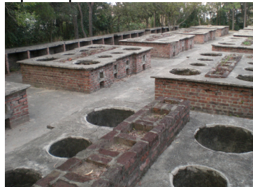
Figure 1 Dozens of stoves arranged in rows.

Some of the stoves are now decorated with flowers and plants – using their concave dips as pots.