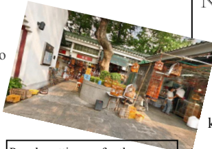
People setting up for the opening business

Hundred of songbirds can be seen in this charming garden, each has its own unique voice. Have a walk down the street, and you will find yourself captivated by the harmony of the songbirds.