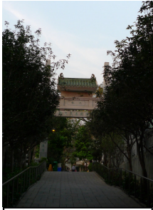
Entrance of Bird Garden

Want to experience a refreshing morning stride? There is no better place than the Bird Garden on Yuen Po street in Mongkok. It is a locally known area where songbird owners carry their beloved pets around, sharing the peaceful moments together.