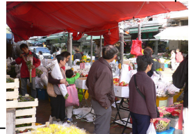
People shopping for flowers in the flower market

The Bird garden is nearby the Flower Market , which is located on the flower market road.