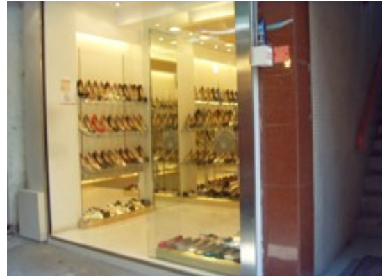
Modern expensive shoe shop

Bargain until you're satisfied. If it doesn't work, walk away and they'll finally agree.