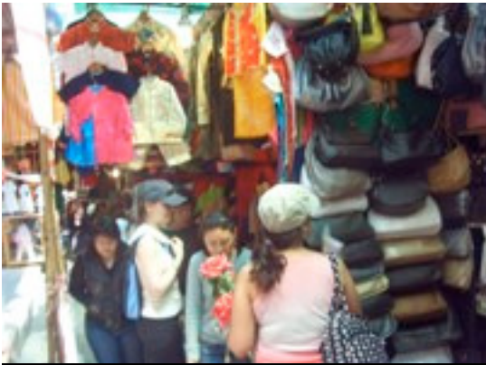
Stall selling handbags, and Cultural Chinese clothing

If you're looking for a place to shop until you drop, then you've come to the right place because all their goods are incredible cheap! Not only is Li Yuen Street East one of Hong Kong's most famous shopping area, it's also a great place to get a good bargain. Its sister lane would be Li Yuen Street West, which sells the same items. When walking through the lane, the first thing that catches every local's and tourist's attention would be the overflowing stalls leaning against each other with a small lane in the middle for people to walk. These stalls sell goods such as socks, clothes, bags, and cultural Chinese items. The prices of these items could range from $50 to around $200, depending on the item!