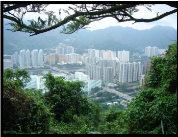
Sha Tin View 5:30pm

This is a place located high up on the mountain in Fo Tan, which you can see a 180° view of Sha Tin. You can see the Sha Tin Plaza and the Race Course when you stand at the balcony of the pavilion. It is a peaceful environment where you can enjoy