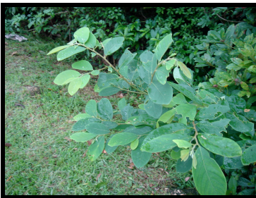
Plant for Chinese traditional snack

Some special raw materials came from this small little area. If you're lucky, you might be able to see some of them. There is a lot of vegetation, which can be used for daily essentials. This plant for example, can be used to make a kind of Chinese traditional