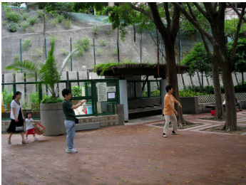
Located at South side of Park

WanChai Park is a beautiful scenery point that shows both the Urban and Rural side of Hong Kong. Inside the park, besides from south, there are tall buildings surrounding the park and also trees and plants, leading to fresh air in the park.