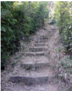
The flights of stairs going up the trail

There is no end to this trail. It is quite a long walk. After about 1 hour of walking through the man