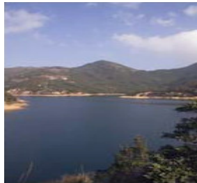
Tai Tam Reservoir

made trial, you would come up to a Tai Tam Reservoir. 大潭水塘. It is the prettiest and nicest Reservoir you can find in Hong Kong. The water is clean and there are greeneries all around it. That is a perfect place for you to take pictures.