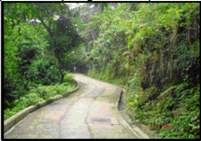
The trail winding through nature

Indulge yourself in the realms of nature that leads you right to one of the most popular tourist destinations in Hong Kong, The Victoria Peak . An ideal trail for relaxation and enjoying the fruits of nature, it serves as a perfect way to get to the peak.