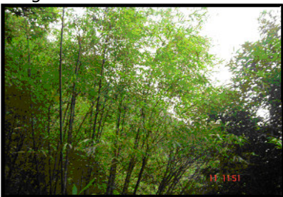
Bamboo surrounding the trail

The trail is surrounded by many different plant species, including one of the few natural resources of Bambusa Vulgaris (bamboo) in Hong Kong.