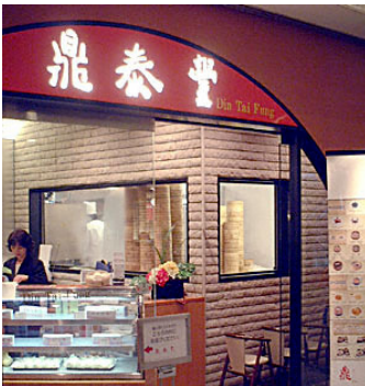
Din Tai Fung at night

A good location for food in Hong Kong, especially for traditional and healthy food would be Din Tai Fung, in Whampoa Gourmet Place located in the middle of Hung Hom. Hung Hom, located right outside the central tunnel is also below the renowned Hung Hom train station, direct trains from the Mainland.