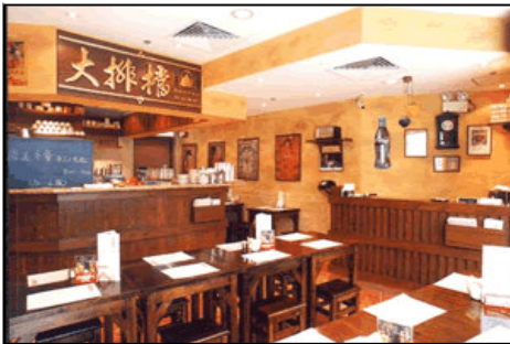
Inside of a Dai Pai Dong Restaurant

One cannot say that they have truly experienced Hong Kong, until they have pulled up a grubby stool under a plastic awning, and ordered Ngau Yook Chau Mien or something similar. Hong Kong's Dai Pai Dong's are a little explored part of its culture, and a real treat to visit. However, these mini restaurants are not the cleanest of places, and as a result there are only 12 left in Hong Kong with a proper license.