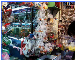
Gold fish store, bags and tanks filled with different types of fish

for fish, fish pellets and much more. This is a street where you can purchase anything to create a small fish tank to an appealing aquarium in your home. Nearby, there is also a flea market, where hawkker stalls sell food, clothing, and even toys at a very low