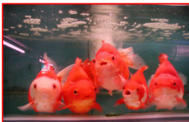
Gold Fish waiting to be brought home

There are also a many types of accessories such as fish tanks, medical treatment