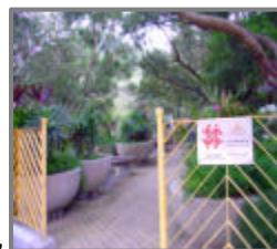
Starting point- Braemar Hill Road

*Difficulty- 2/5 (3/5 if tracing stream). Give yourself around half a day to walk and explore the area.