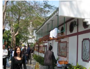
Photo 1: Rows of birdcages brought by visitors from all over Hong Kong

Never seen special gardens especially created to allow people interact with birds? Then the Bird Garden located on Yuen Po Street in MongKok is the place for you to go. The Yuen Po Street Bird garden is a Chinese style theme park that features many different types of birds here, most brought by bird owners located all over Hong Kong. The bird garden is a popular destination as a rendezvous for many bird fanciers. These admirers, many of which are seniors bring their birds in their birdcages here in order to have interactions with other bird owners. They come and hang their birdcages next to others', as in photo 1. They come here to express their opinions about not only their own birds, but others' as well. In this bird garden, the owners have a bird convention of their own!